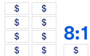
Wealth gap between white and Black families. 1

Black households hold significantly less wealth than white households.